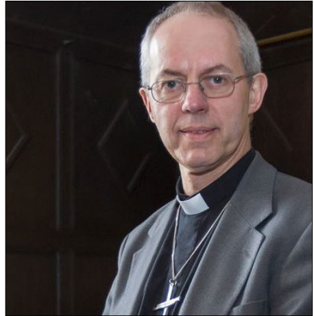
The Most Revd Justin Portal Welby, 105th Archbishop of Canterbury.

We have responsibilities to act, to do what we can to make a difference, to work for our neighbour's flourishing, to bring justice. We have responsibilities