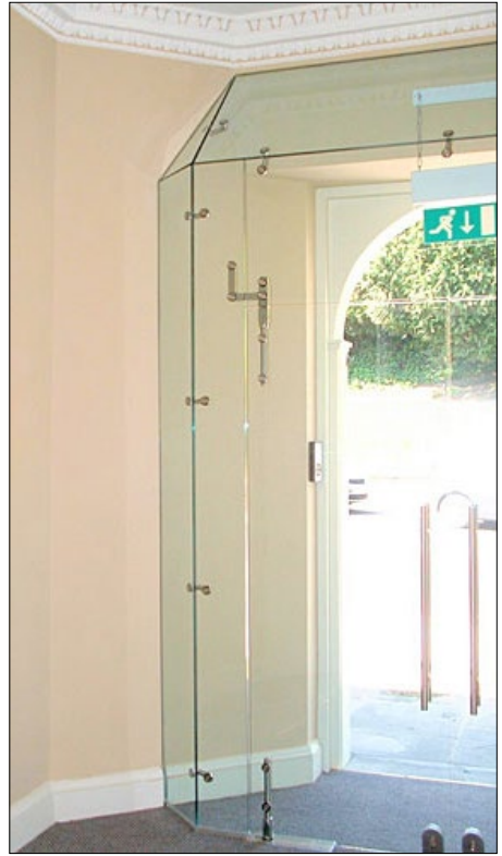
Above: the glass “airlock” doors in St Swithin’s, Walcot. At Christ Church the airlock structure would have a solid top with lighting in it, not glass. Below: the proposed disabled access ramp to the North-West door would have a gentle gradient. Photo and sketch courtesy of Chedburn Dudley.

Also proposed is renovating, repainting and panelling the entrance lobby and toilet area, and building a fully-accessible disabled toilet. A new glass “airlock” door just inside the entrance is proposed, which will help keep both the lobby and the toilet areas warmer. It will also make it possible to remove the wooden inner “draught-proof” structure and install glass inner doors in its place. The existing outer doors would be unchanged, but when they're open, there would be a much more welcoming view through the two sets of glass doors right into the church.