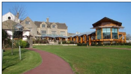
Dorothy House is based in Winsley House.

social and spiritual care to patients and their families facing life-threatening illness, death or bereavement, who have specific problems which need our specialist skills. In partnership with all others involved, we focus on quality of life, respecting the uniqueness of each person and their family. We seek to promote the development of palliative care through education of others and research. For more information, visit www.dorothyhouse.co.uk