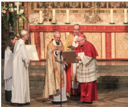
Archbishop Justin Welby presents Synod’s resolution to Catholic and Lutheran representatives.