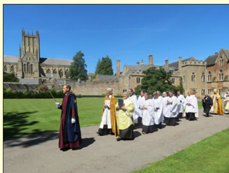
In our diocese, 12 priests and 11 deacons were ordained in Wells Cathedral in July 2017.