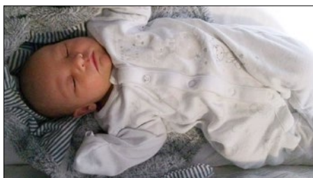
What's going on here? And who is this? See p.3!