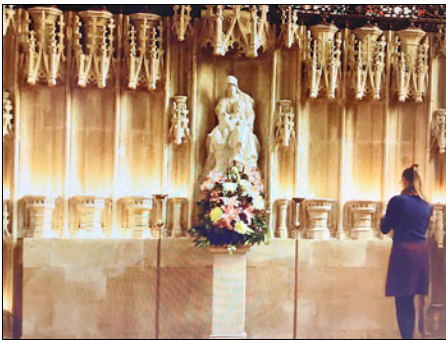
The “From Lamentation to Hope” service, for all those bereaved during the coronavirus pandemic, is available to view at YouTube.com/BathandWells .

You can also find an All Souls or Remembrance service on the Church of England website www.ChurchOfEngland.org on 1 and 8 November. Alternatively you can find details of more local services (subject to lockdown) at AChurchNearYou.com .