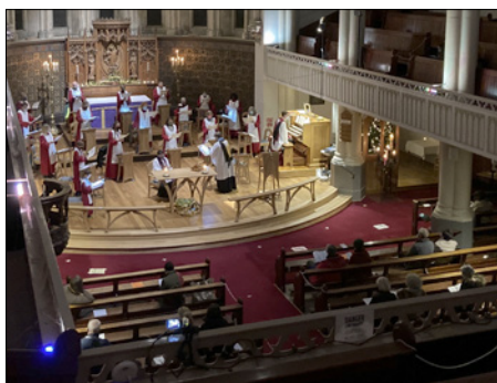
Top: the Christmas tree in our new south chapel was hung with golden decorations given by members of the congregation. Below: the candlelit Christmas Carol Service.