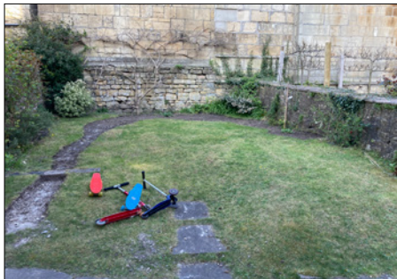
The garden to the north of the apse.

We will continue to keep you updated on progress.