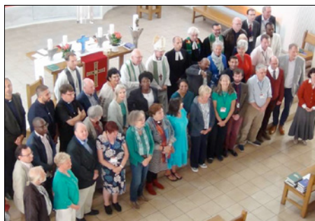
The congregation of Christ Church, Kyiv.

To find out more about how you can help those fleeing Ukraine, visit the St Michael Chapel in Christ Church or see https://www.churchofengland.org/resources/community-action/war-ukraine-responding