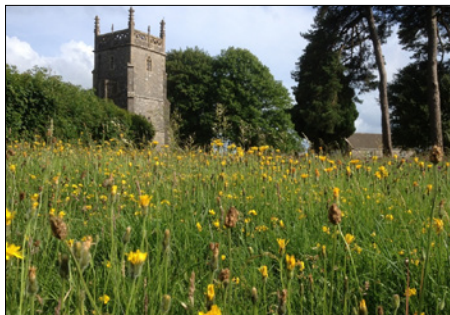
Priddy churchyard.

For more about Wilder Churches and Eco Church visit bathandwells.org.uk/environment .