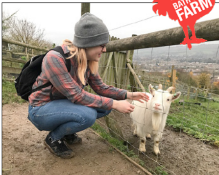
Bath City Farm is situated on a 37-acre plot between Twerton and Whiteway.

Find out more at http://bathcityfarm.org.uk .