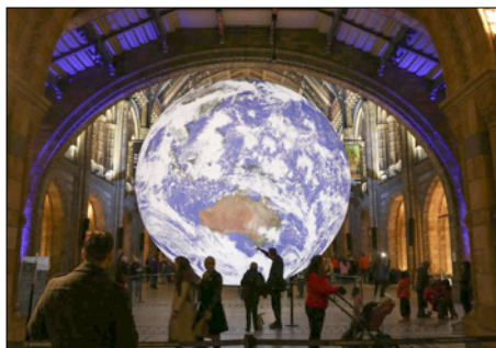
The Gaia installation in London's Natural History Museum. See more at https://my-earth.org/about .

The Treasuring Creation Festival focuses on appreciating and caring for our planet. Events include an art exhibition featuring details from the Abbey's stained glass windows and diptychs from the Abbey's collection, with a short commentary shining a light on treasuring the Earth from a Christian perspective; tours of the Abbey; activities and trails for schools and families; workshops; and Extraordinary Earth Day on Saturday 30 September, 10am–5pm. This is a day for all to see what's going on locally to help combat climate change and support the city in living more sustainably. Details of the festival and booking info as relevant at www.bathabbey.org/gaia .