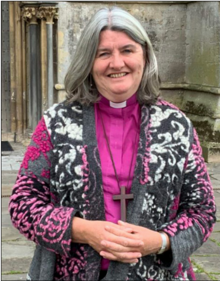
From the Rt Revd Ruth Worsley, Bishop of Taunton

I am shortly leaving Bath and Wells for a time to serve as interim Acting Diocesan Bishop in the Diocese of Coventry. You may know that the city of Coventry saw some very heavy shelling during World War II, which resulted in the destruction of the Cathedral. A new Cathedral has since been built and stands alongside the old ruin as a testament of hope. Though different in style, there's a harmony of old and new. It shows us where conflict can destroy, peace can be found as we seek to live together as the people of God.