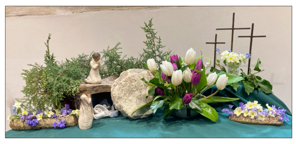
This year's Easter garden, in the St. Michael Chapel.