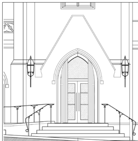
An impression of the renovated entrance. The main wooden doors will open outwards within the outer arch, with new oak-framed glass doors just inside to keep the weather out and the heat in.

There will be some disruption during the works. Our just-refurbished main toilets will not be accessible, and the main doors will be closed off for at least the first six weeks. Entry to the church will be through either the choir vestry door or the south-east door (off Julian Road), where a temporary porch will be erected to help keep the heat in. Thanks for your patience and understanding!