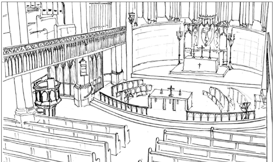
A visualisation of the proposal for the east end reordering, based on a sketch by Hugh Conway-Morris.