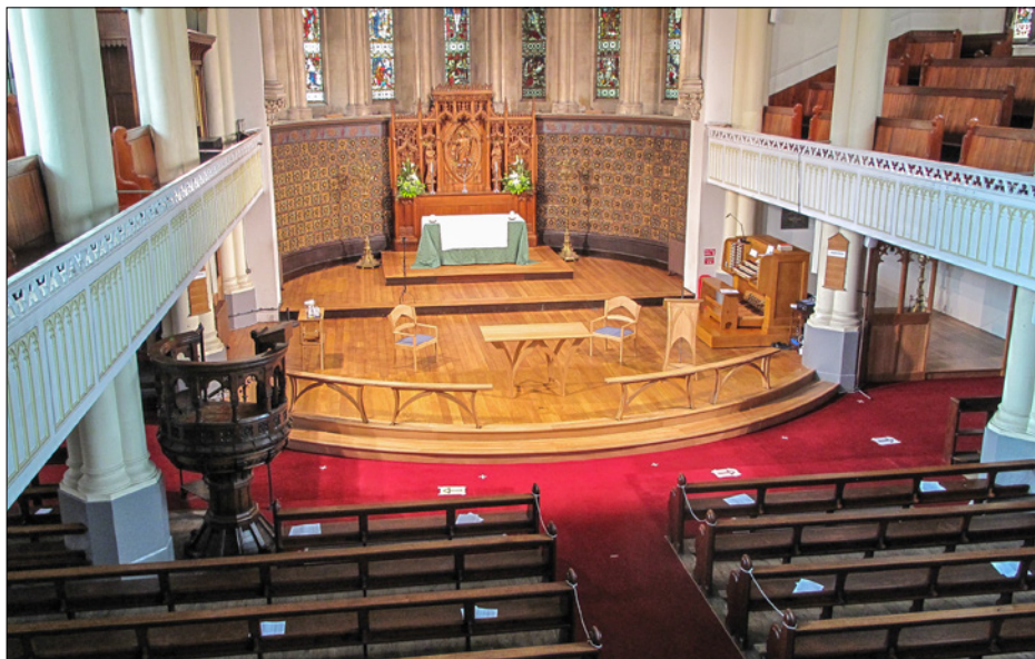
Our reordered east end, with the communion rail, south chapel screen and the first of the new furniture.

For those not able to come in person, the Sunday Eucharist will continue to be streamed at www.facebook.com/christchurchbath . We hope the service will be an equally meaningful and spiritually uplifting experience whether you are worshipping in the building or online. Other “virtual community” activities will also continue – see page 2.