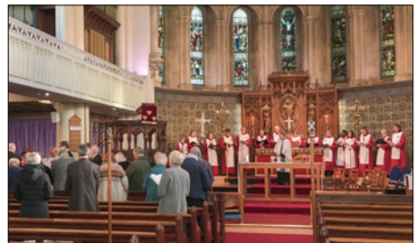
The choir on Remembrance Sunday 2019.

The Westminster Catechisms were written during the Civil War which resulted in the execution of Charles I. To many the king was God’s representative on earth. His shock of his execution must have produced the same sense of dislocation from normal life which we are feeling. But out of those strange times came a revelation which still illuminates our faith and lives. They were able to glorify God in their strange times and circumstances, and by the grace of God, so can we.