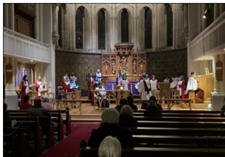
This year's Advent Carol Service. Our Christmas Carol Service will be equally memorable.