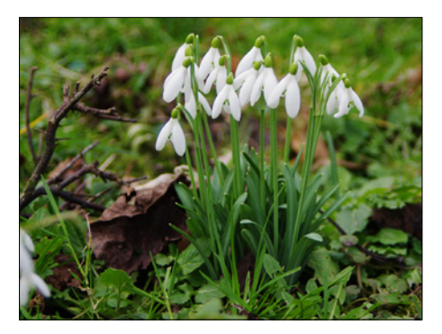
Snowdrops (Galanthus) are commonly known as "Candlemas bells" because they appear in Februarv around the time of the feast of Candlemas.

Remember the snowdrops. Every Lent, hope springs up like the snowdrops, and like them, in the middle of our worry and stress and boredom, hope gleams.