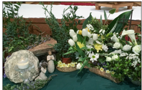
Our last Easter Garden at the altar, from 2019.