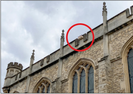
A nesting box for swifts, a declining species, has been attached to the north side of the building.