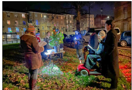
Carols on the Green – see page 3.