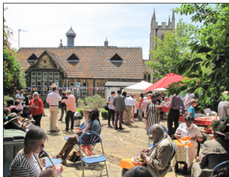
The Windrush Sunday Caribbean cookout at Christ Church in 2018.

Our annual Windrush service takes place on Sunday 19 June, when in our 10am Eucharist we will mark the arrival of the Windrush and reflect on the experiences of the Caribbean community locally and nationwide. This will be followed by our traditional Caribbean cookout – all welcome!