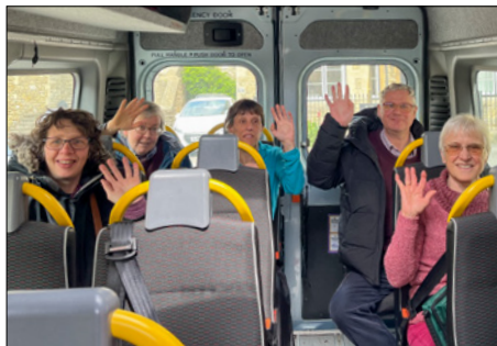
The Cedar Tree outing to Sham Castle.